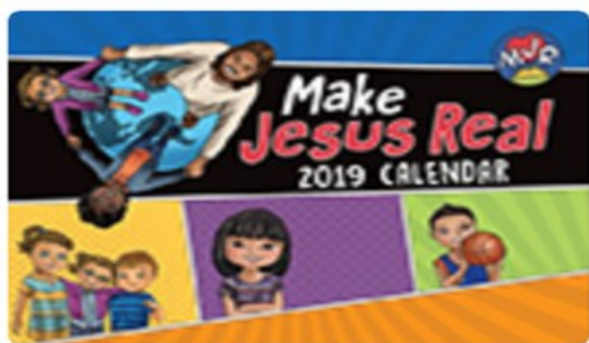
MJR 2019 Calendar